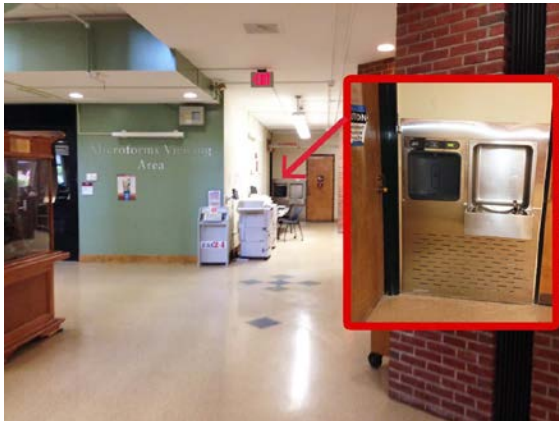
New Hydration Station – WEB Dubois Library Composite Material