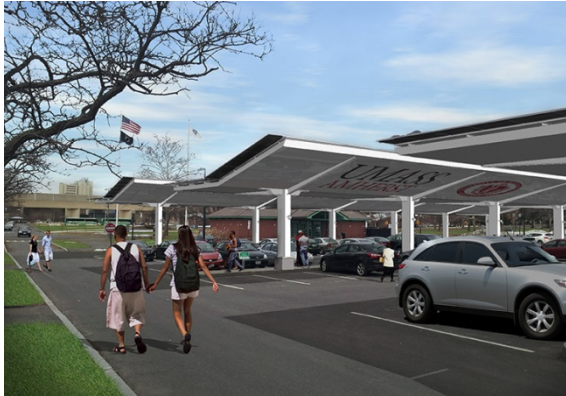
Robsham Visitor Center Solar Canopy rendering Center Green Roof