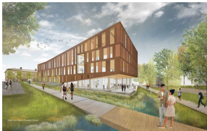
Design Building Rendering – Wood